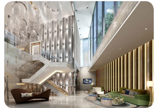
This clubhouse atrium artists' impression gives a sense of the scale of the above and below-ground areas

The Victron range of pure sine wave Inverters/Chargers provide advanced solutions to ensure that Newton pumping systems continue pumping during power interruption.