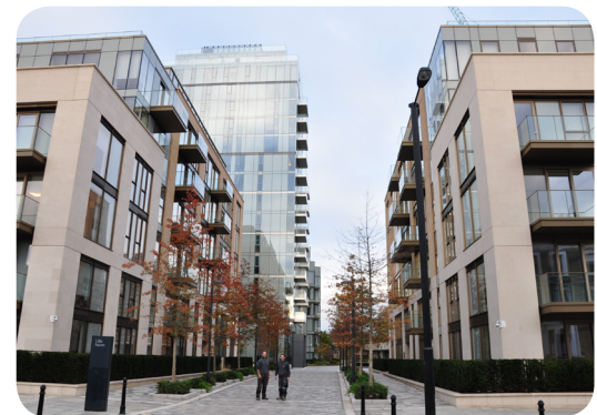
The finished Lillie Square development will be one of the most prestigious developments in London