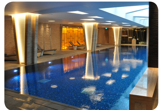
The below-ground resident's clubhouse also includes a luxury subterranean swimming pool